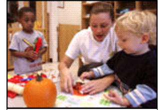
The Kent Family Center offers high-quality child care and after-school programs for children.