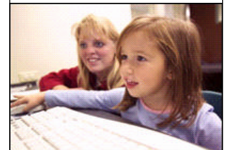
Below, Garrett County Community Action Council works to provide many opportunities for families in Western MD.